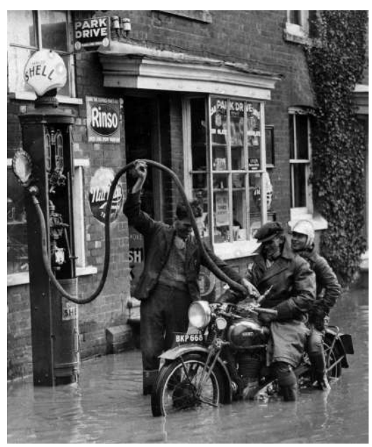
And of course, your fuel should not be contaminated with water.