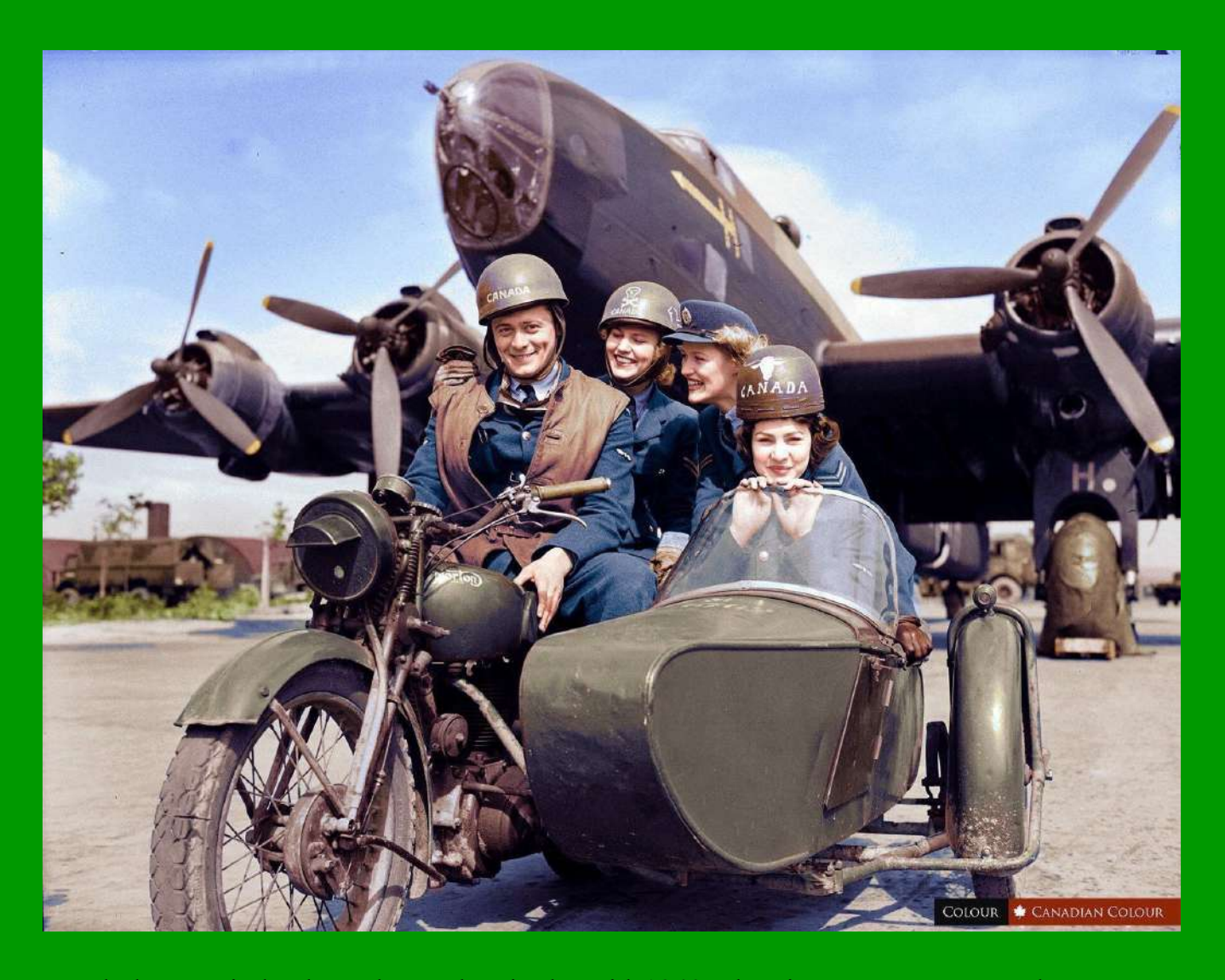
Fabulous period colour photo taken in the mid-1940s showing a merry crew, at least two of which have 'Canada' on their helmets, aboard a BSA M20 sidecar outfit.