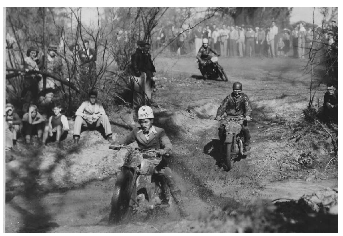
Riders approach a creek crossing during a Kogarah/Hurstville MCC event.